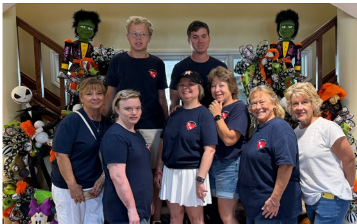
Pure Hearts and Hearts shared their hearts with our families with super yummy homemade sub sandwiches, fresh fruit salad, assorted chips and dessert.