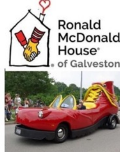
Caravan down to Galveston with the Ronald McDonald Shoe Car!

Meet at Texas City Buc-ee's between 8 am – 9:30 am. Drivers meeting will start at 9:30 am. Promptly at 10 am with police escort we will travel to the Ronald McDonald house in Galveston. Please follow one another safely (DO NOT USE YOUR HAZZARDS). Thank you. Have Fun, Be safe and Be Blessed.