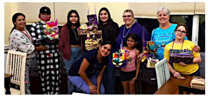
Our Mardi Gras season was kicked off when Da Krewe du Roux brought their Too Kids Krewe to help our kids craft beautiful and fun shoe box floats. Our kids love this kind of event, the camaraderie was wonderful, and the "floats" came out great!